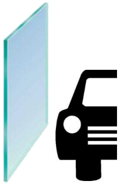
Single Pane ThermaPro Low-E

Single pane Low-E glass reflects the sun for energy efficiency. This Low-E option provides an energy efficient alternative to traditional clear insulated glass. Available in clear glass.